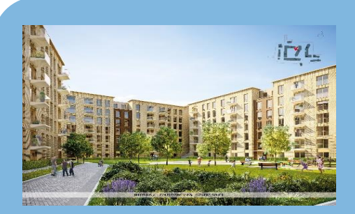
Proposed Roots Hall development